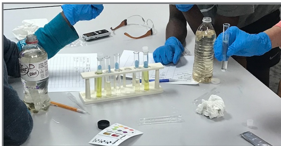
Figure 2. Students Testing the Water During a Lab Experiment

with whom students can connect, the illustrations showed sights they might see around town, such as culverts, waterways, and roadsides littered with garbage. To develop students' critical thinking skills and awareness of the importance of stopping pollution, we asked questions that connected the reading with their personal experiences: "Have you ever noticed any garbage on the ground when you were walking down the street or riding in a car? Is the garbage you saw a form of pollution? How can it affect our water?"