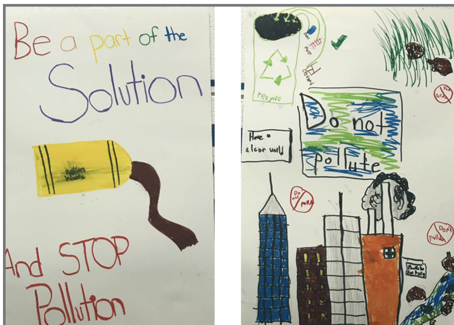
Figure 1. Two Pollution Posters Created by Students