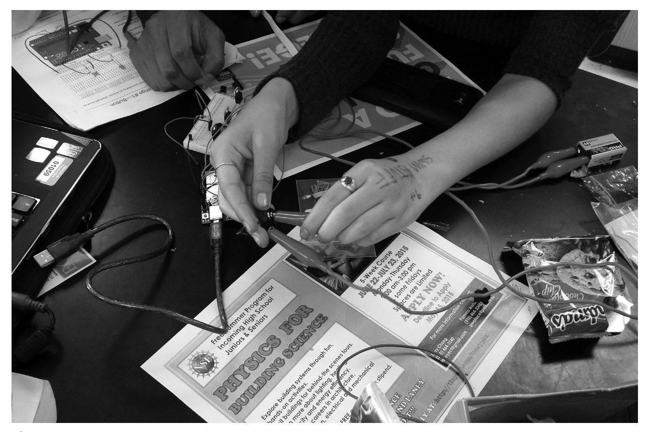
Figure 2. Mentor-supported work with an Arduino

gives youth the space to take risks, make mistakes, and learn how to work through setbacks—all important steps in personal development that are more valuable in the long run than making the perfect project.