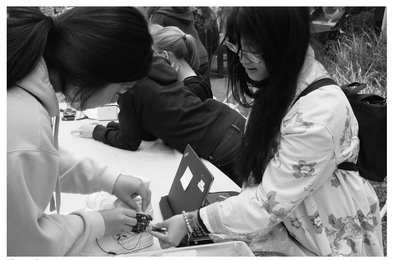
Figure 3. Girls preparing to present their shoes for the visually impaired at Maker Faire